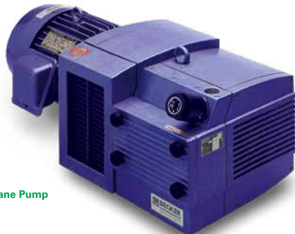
X-Series Dry Vane Pump

For more information on the Advantage-X systems, call our factory at 888-633-1083, and ask to speak with your local Becker representative.